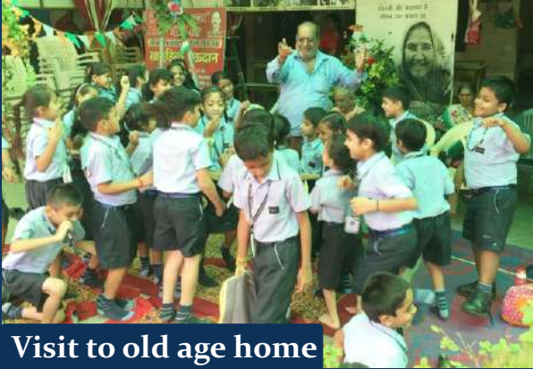
Visit to old age home