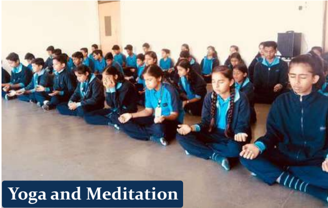
Yoga and Meditation

Yoga is the journey of the self, through the self, to the self.