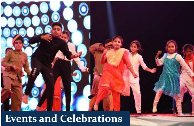
Events and Celebrations